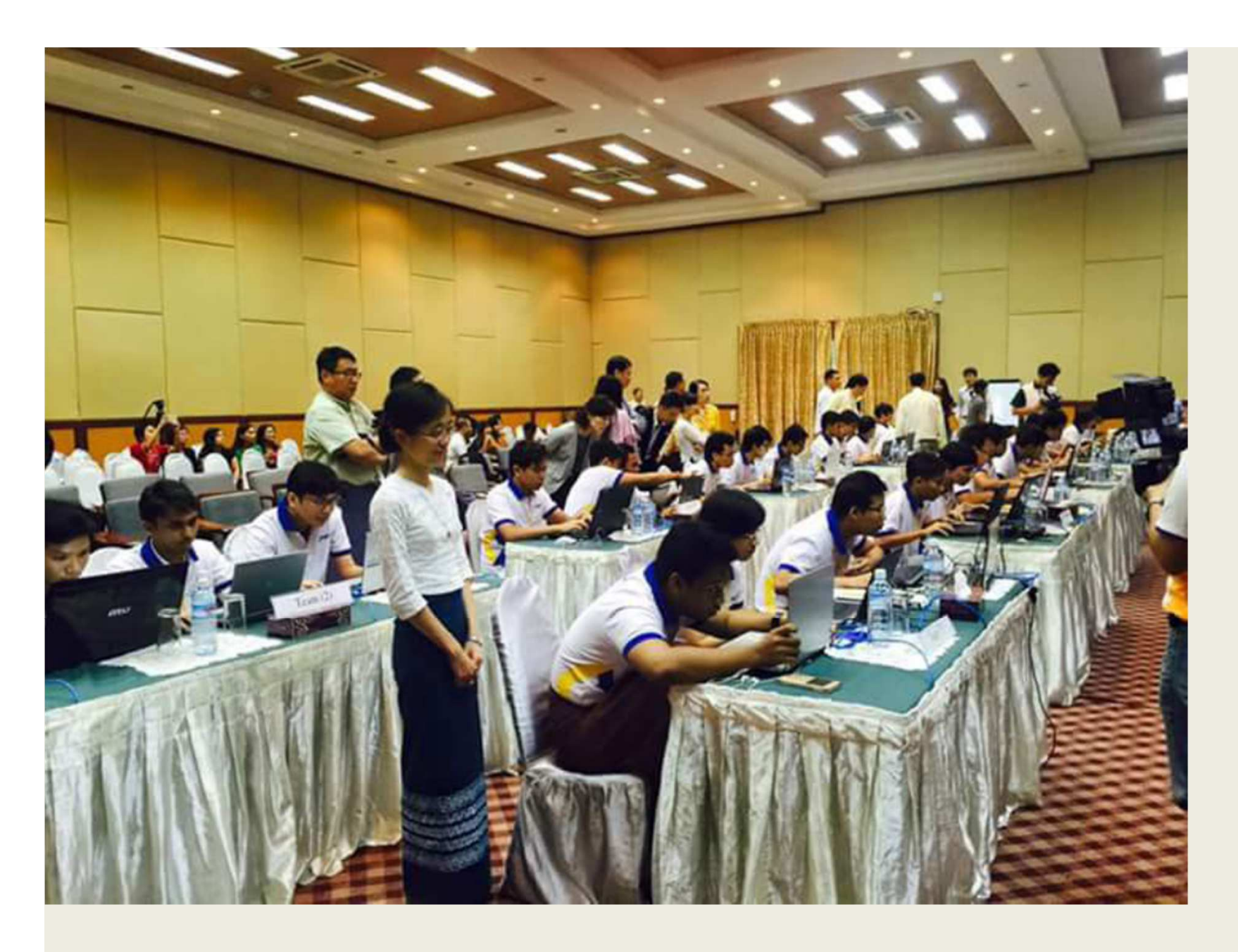
ICT competition in university Students